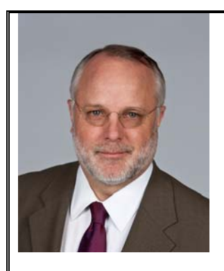
Director since: June 8, 2006 Pennsylvania, U.S.A. Independent